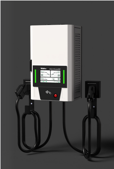
DC WALLBOX WALL MOUNTED

The DC Wallbox mounted on the wall is designed to minimize the installation space and ensure an easy use of the charger even in the most constricted conditions.