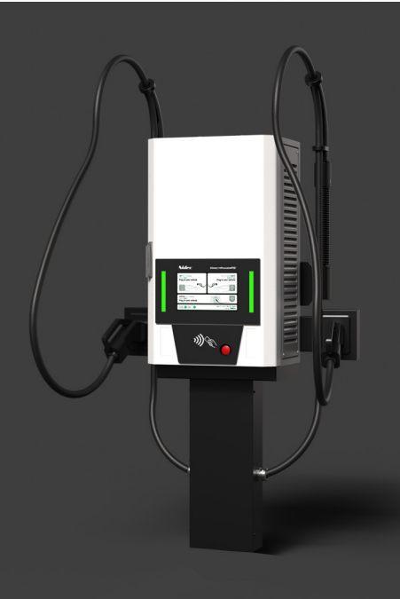
DC WALLBOX ON THE PEDESTAL

The robust connector holders keep cables neatly in place, eliminating tripping hazards and maintaining a tidy charging area.