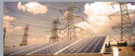
Transmission and distribution, renewables' integration, smart grid applications in the energy sector