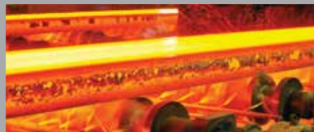
Electric arc furnaces and rolling mills in the steel industry