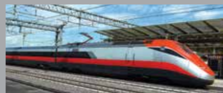
Voltage support systems in railway's traction lines