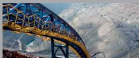
Wrapper, conveyors, crushers in mining industry